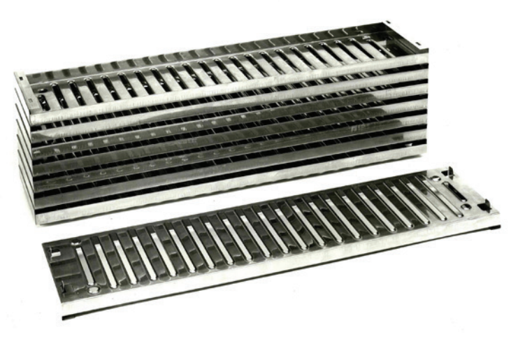
Parallel Downflow Trays