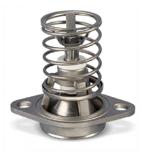
COCHRANE<sup>®</sup> by newterra Accu-Spray Nozzle