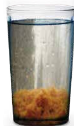
Post Treatment (Iron = 0 PPM)