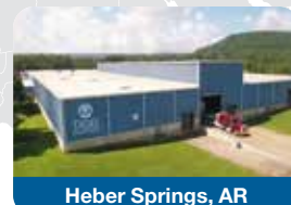
Heber Springs, AR