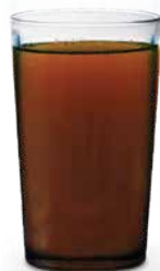
Pre-Treatment (Iron >100 PPM)