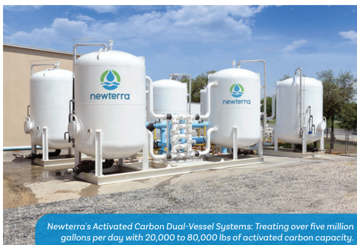
Newterra's Activated Carbon Dual-Vessel Systems: Treating over five million gallons per day with 20,000 to 80,000 lbs of activated carbon capacity.

Newterra supplied three activated carbon dual-vessel skid systems capable of purifying more than five million gallons of water daily. Dual-vessel activated carbon adsorption systems like these are ideal for municipal water purification since they can contain from 20,000 to 80,000 lbs of activated carbon for treatment. By increasing the amount of carbon online, a system needs less frequent media changeouts. In addition, varying vessel diameters and heights allow the users to select the system that best fits their available footprint. Interconnecting 12-valve pipe