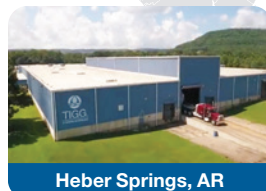
Heber Springs, AR