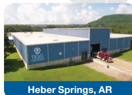
Heber Springs, AR