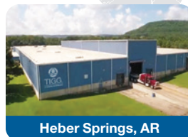
Heber Springs, AR