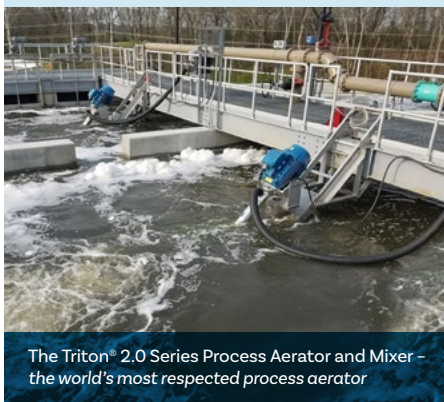
The Triton® 2.0 Series Process Aerator and Mixer – the world's most respected process aerator

From advanced treatment processes to decentralized wastewater systems, our solutions are tailored to enhance efficiency, reduce environmental impact, and contribute to the overall well-being of the communities we serve.