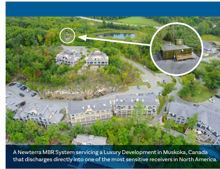
A Newterra MBR System servicing a Luxury Development in Muskoka, Canada that discharges directly into one of the most sensitive receivers in North America.

Thanks to their robust design, you'll enjoy a long-lasting performance from our surface aerators in the most remote, debris-heavy environments and activated sludge systems. Some of the additional benefits include upgrading and expanding