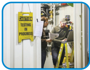
Startup & Commissioning Services