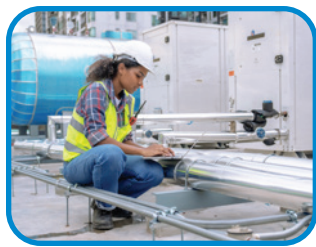
Inspections and Audit

All personnel involved in commissioning, warranty service, and ongoing support are factory-trained and highly experienced with the specific equipment and technologies we supply. Our commitment to lifecycle support is reflected in our ability to provide scheduled maintenance, emergency response, and long-term service programs tailored to customer needs.