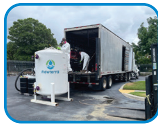
Completed Carbon Removal